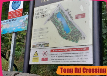
Tong Rd Crossing