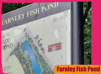
Farnley Fish Pond