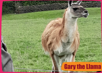
Gary the Llama