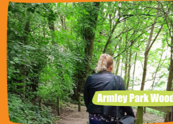
Armley Park Woods