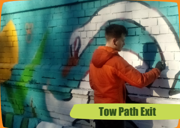
Tow Path Exit